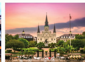
St. Louis Cathedral