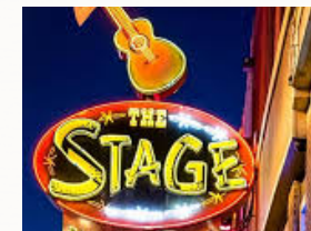
Broadway "Honky Tonk Row"

We roll into Nashville via Broadway and its famous "Honky Tonk" bars, live music from every doorway! Morning takes us to Studio B the recording studio where our legends record their hits. Afternoon takes us to the Country Music Hall of Fame and a private session with local musicians. This evening enjoy some live music at our joyous farewell dinner.