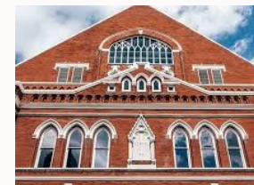
The Ryman Auditorium