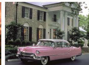
Elvis Presley's home "Graceland"